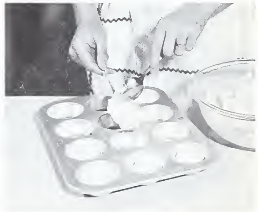
N-39871--Spoon batter into muffin pans, filling cups \frac{2}{3} full.